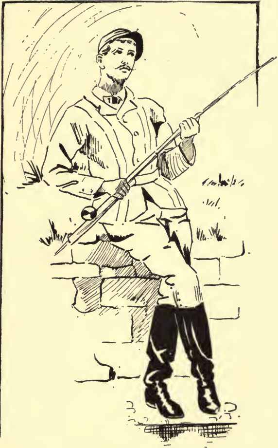
"A youth of shop-walker beauty, in the guise of a fisherman."